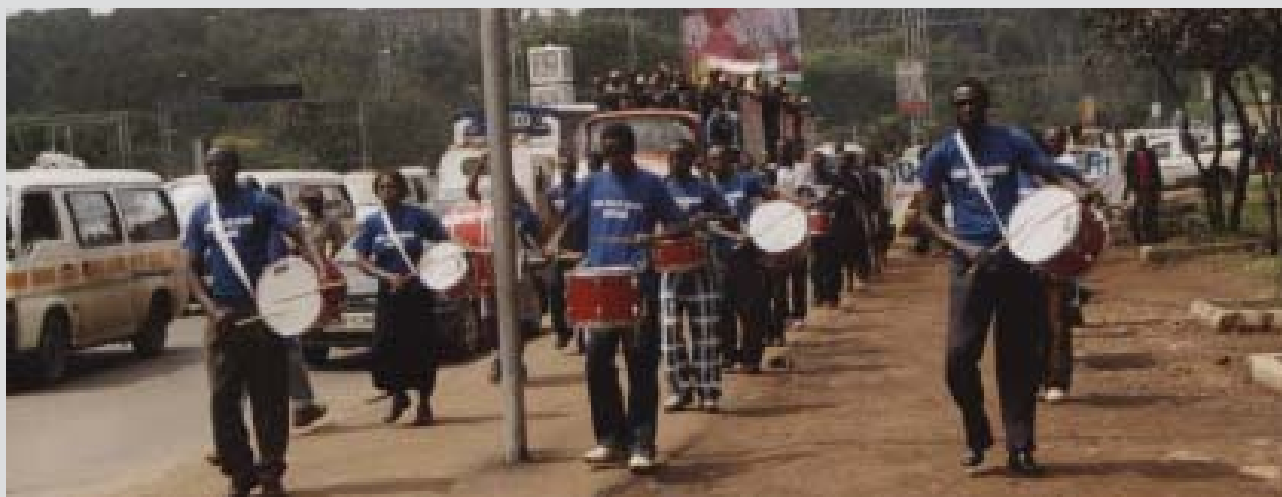
Marching band joins a truck procession. The band is made up of children of truck drivers who have passed away.

In support of national scale up of HIV testing and counselling activities in Nairobi, Coast and Nyanza provinces, Kenyan campaigners will hold community mobilisation processions on 28th and 29th of November 2007 targeting different groups. One procession will target university students and youth to encourage HIV testing, another road show, which will encourage the general public to undergo Voluntary Counselling and Testing (VCT), will take place in Nairobi's suburbs of Kibera, Dagorett, Kawangware, Uthiru and Kangemi.