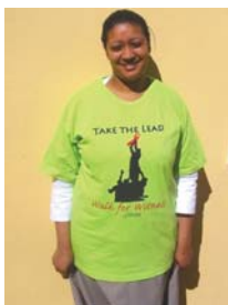
"Walk for Witness" T shirt

On World AIDS Day, the Anglican organisation Fikelela, is coordinating the "Walk for Witness." The purpose of the day long event, which is kicked off by a walk attended by many churches and individuals, is to challenge churches to take the lead in their communities with the message of stopping discrimination against people living with HIV. The walk will begin at 11 am and end up at the Turfhall Stadium, where the event will include a speech by Cape Town Mayor Helen Zille, performances by dance troupes and DJs, food and much more.